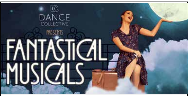
Fantastical Musicals Dance Collective

Please call 0508 266 237 or visit www. daytimeconcerts.co.nz to book tickets