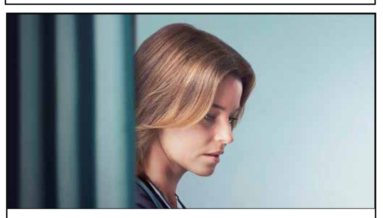
A Mistake (M) Running Time: 101 minutes