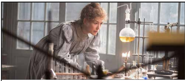
Radioactive (M) Running Time: 110 minutes

In advance: Adult $11, Senior $9, Student/Child $9 On the door: Adult $14, Senior $12, Student/Child $12